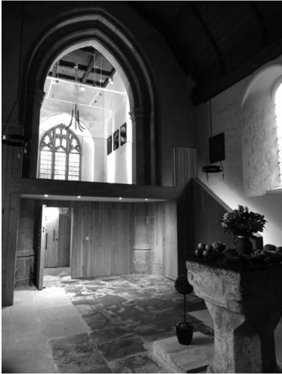
Figure 1: Church of St Nicholas, Great Wilbraham, England; west end.

a gathering space at the rear of the nave. Against the preference of some of the statutory consultees, the gallery projects forward of the base of the tower.